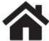
Safety at home and technology