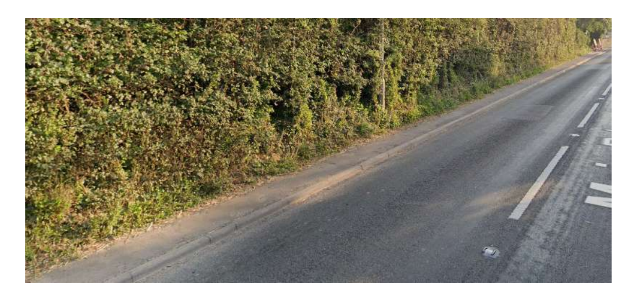
Photo: A39 between Burcott & Mill Lane, Coxley looking east. (Google Streetview 2021)

Speed Indicator Device Results for Coxley, 2022-preseent. All devices are located on the A39.