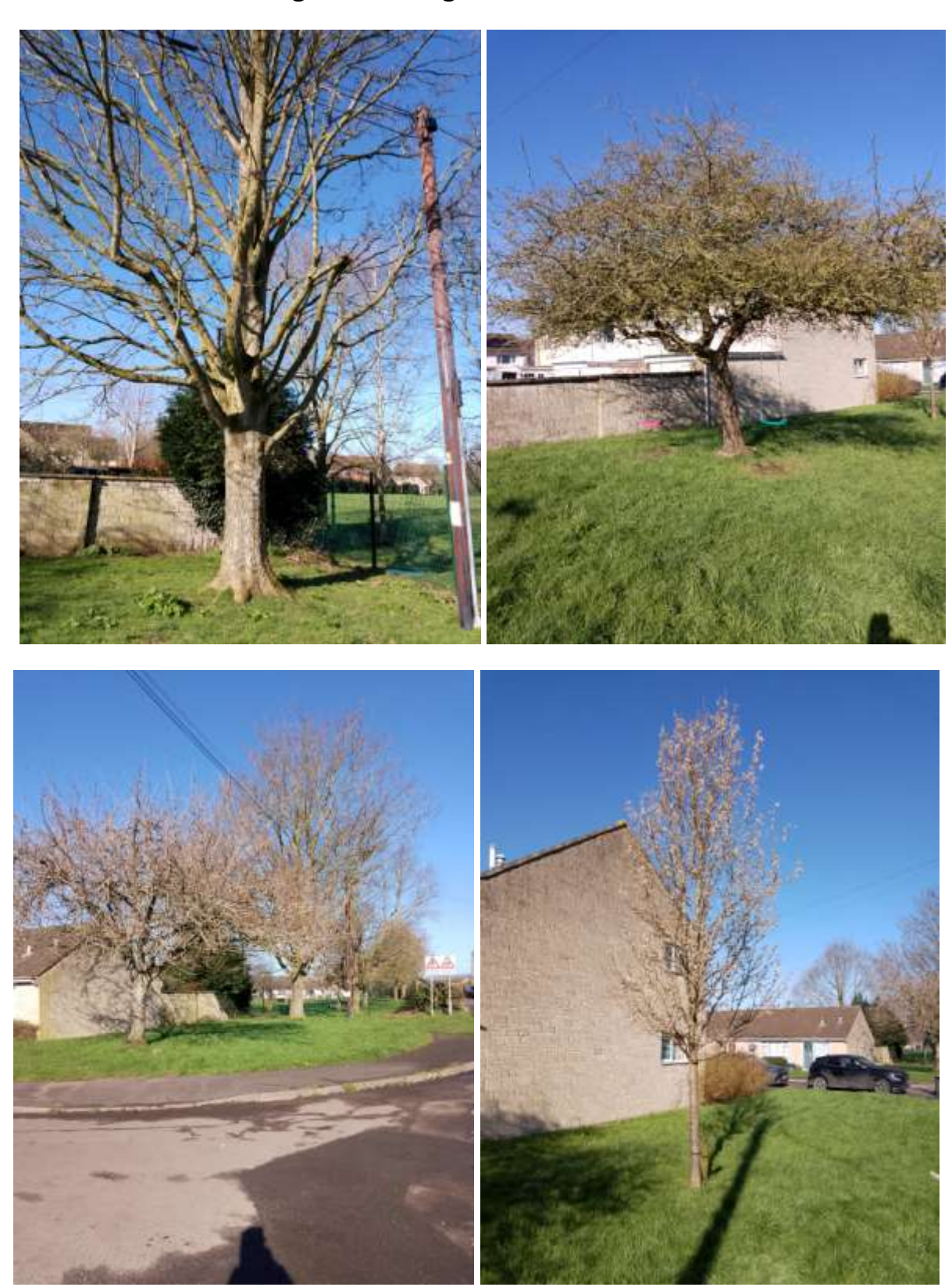
ANNEX C: Trees & swings at Bowring Close